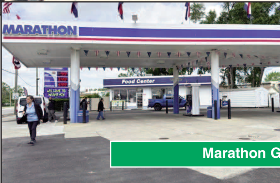
Marathon Gas Station