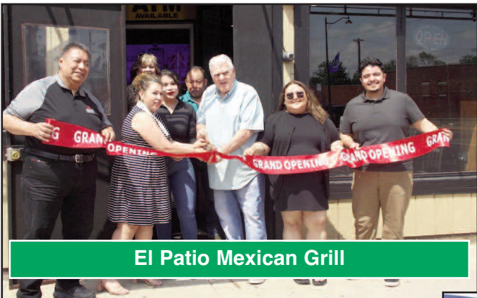
El Patio Mexican Grill