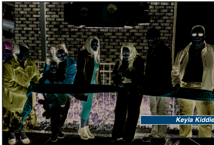
Keyla Kiddie Kollage