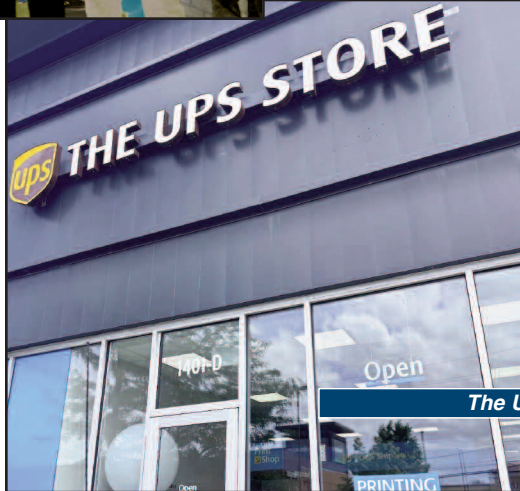
The UPS Store